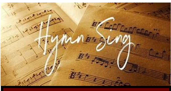
Sunday, August 22 at 6:00 p.m.

Every Saturday at about noon, we receive food to share with the needy. If you are in need, or know anyone who is, please come pick up some food to share. There is a variety of food items available. Come and be a part of this blessed ministry.